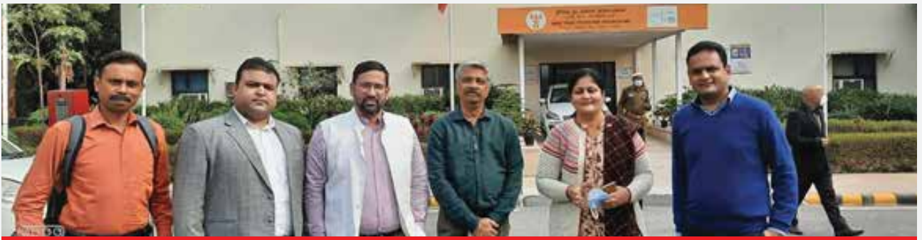
Consultative Meet by ITPO - February 28, 2022

IEIA Executive Committee members had earlier met ED ITPO and Head of the Business Development Division twice during the past 2 months for discussions on key points concerning Exhibition Organisers.